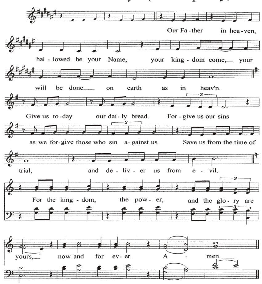
© 2000 Wildgrove Music (BMI) 417 Hope Avenue, Franklin, TN 37067. For information and permissions call: 615/771-0248